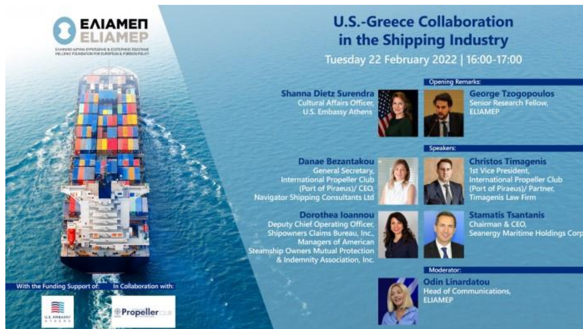
The panelists of the webinar